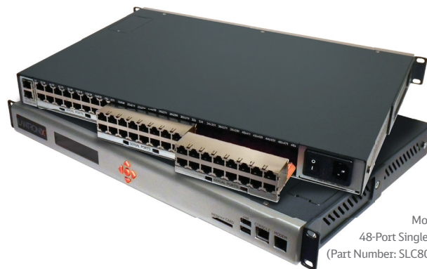
Model shown: 48-Port Single AC Supply (Part Number: SLC80481201S)

Protecting IT resources is a top priority. The SLC 8000 provides security features such as SSL and SSH for data encryption in addition to remote authentication for integration with other systems already in place. For added protection, the SLC 8000 also includes firewall features to reject connection attempts or block ports and has NIST-certified AES encryption.