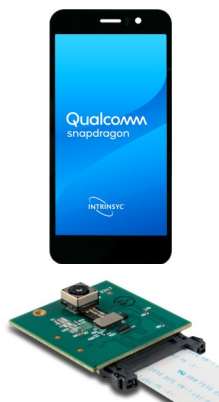
Optional Display & Camera

Development Kit includes: Carrier board, SOM, 12V power supply, HDMI cable, Quick Start Guide, access to full documentation, SW updates, and basic development kit support.