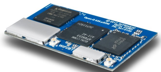
Open-Q 626 μSOM