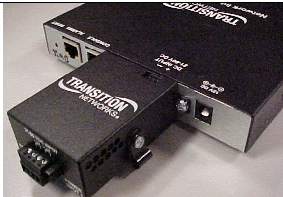
S3290-RPS shown attached to a S3290-24