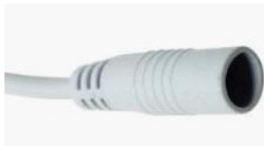
INPUT DC FEMALE: 5.5 X 2.1mm