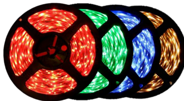
RGB + White

The Spectrum Series 24 Volt RGBW Indoor System from Inspired LED is a creative, customizable way to add a splash of color to your world! Available in custom lengths or 5 meter reels, these unique strips provide a range of up to 65 million color combinations. Energy efficient, long lasting, and dimmable with compatible systems, Inspired LED flex strips are the perfect option for any lighting application.