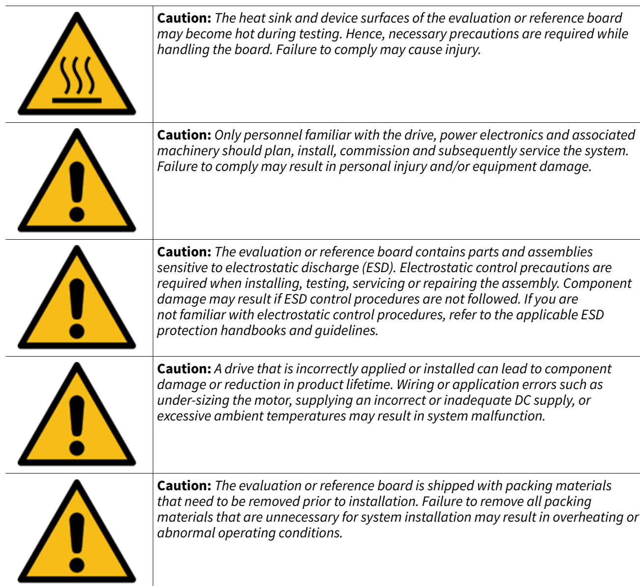
Table 1 Safety precautions

Note: Please note the following warnings regarding the hazards associated with development systems.