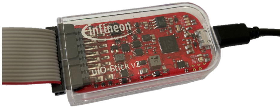
Figure 1 uIO-Stick v2

The uIO-Stick v2 registers as an HID on the PC, so no driver installation is needed.