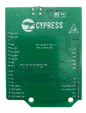
Figure 2: CYBT-213043-EVAL Bottom View

SW1: Reset Switch routed to the XRES connection on the module.