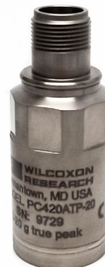
Table 1: PC420ATP-yy model selection guide

Wilcoxon's PC420ATP series sensors provide 24/7 output of true peak acceleration, allowing for continuous trending of overall machine vibration in process control systems. True peak output is particularly useful in detecting loose parts on reciprocating machinery. The trend data alerts users to changing machine conditions and helps guide maintenance in prioritizing the need for service.