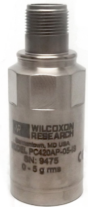
Table 1: PC420Ax-yy-IS model selection guide