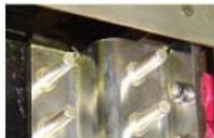
Chassis showing application of Plastic SurLok™

Notice: Specifications are subject to change without notice. Contact your nearest Amphenol Corporation Sales Office for the latest specifications. All statements, information and data given herein are believed to be accurate and reliable but are presented without guarantee, warranty, or responsibility of any kind, expressed or implied. Statements or suggestions concerning possible use of our products are made without representation or warranty that any such use is free of patent infringement and are not recommendations to infringe any patent. The user should assume that all safety measures are indicated or that other measures may not be required. Specifications are typical and may not apply to all connectors.