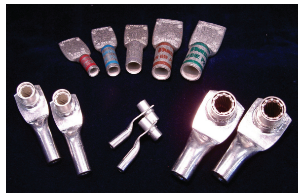
Industry Standard Color Coding