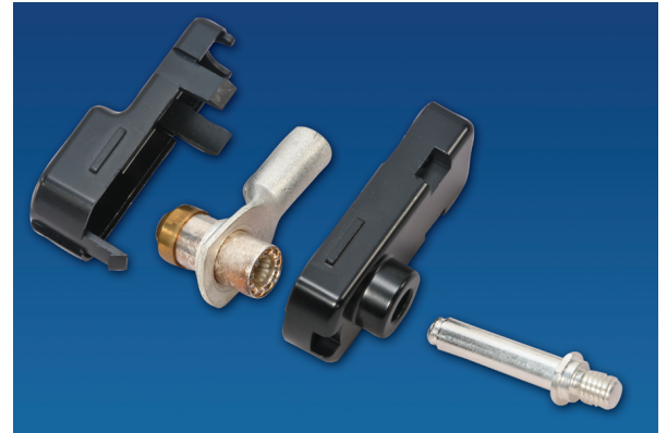
SurLok™ with Plastic Housing

For more information: Amphenol Industrial Operations Phone: 607-563-5011 Web: www.amphenol-industrial.com