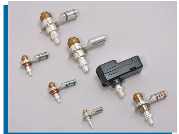
4 Sizes, 7 Ampacities (see table on back)