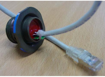
RJF TV 7SA2 G 05 100BTX