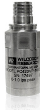
Table 1: PC420Vx-yy-IS model selection guide