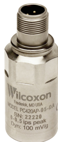
Table 1: PC420Ax-yy-DA dual output model selection guide

Wilcoxon's 4-20 mA vibration sensors integrate easily with an existing PLC, DCS or SCADA system. The PC420A-DA series dual output sensors provide 24/7 monitoring of overall machine vibration for continuous trending, alerting users to changing machine conditions and helping to guide maintenance in prioritizing the need for service. The choice of true RMS, true peak or peak output allows you to choose the sensor that best fits your industrial requirements. The sensor's 4-20 mA output is proportional to acceleration vibration. The dynamic output signal is derived from an internal buffered amplifier and requires that the 4-20 mA loop be powered.