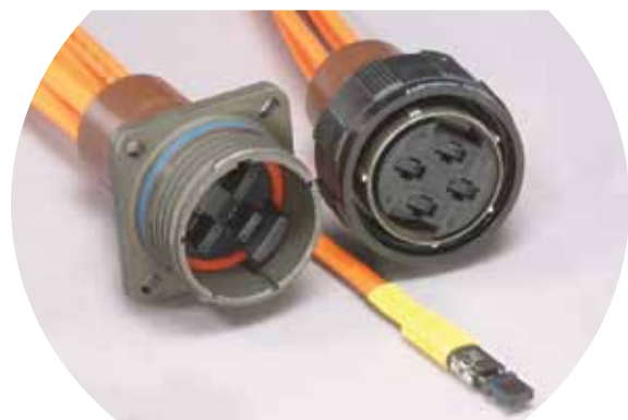
MT Ferrule Fiber Optic Termini