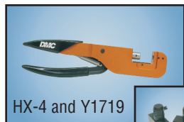
HX-4 and Y1719