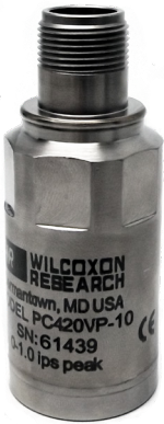
Table 1: PC420Vx-yy model selection guide

Wilcoxon’s PC420V series sensors provide a 4-20 mA output proportional to velocity vibration, allowing for continuous trending of overall machine vibration. This trend data alerts users to changing machine conditions and helps guide maintenance in prioritizing the need for service. The choice of RMS or peak output allows you to choose the sensor that best fits your requirements.