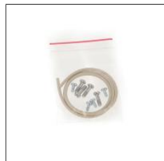
Hardware includes lid screws, PC board screws, and gasket