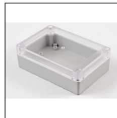
Clear Lid (polycarbonate version shown)