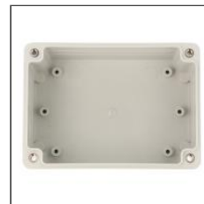
Internal mounting points for PC boards or panels