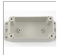
Internal DIN rail mounting point.