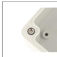
Features corrosion resistant inserts for lid assembly