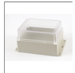
Some models supplied with deep lids.