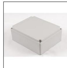
Some models supplied with styled lid.