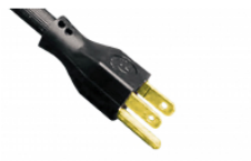
5-15P Straight Blade