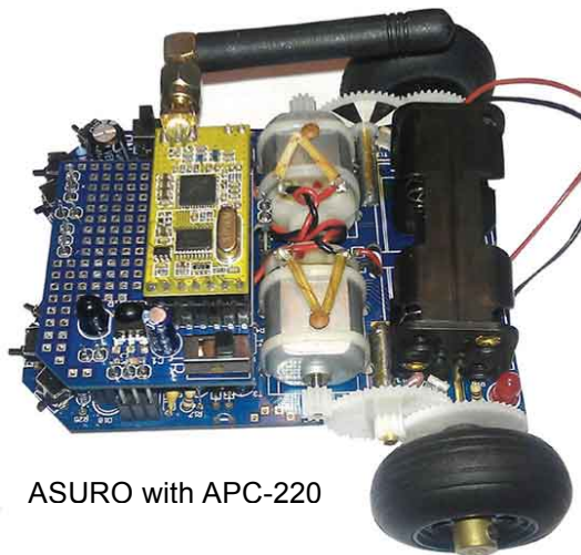
ASURO with APC-220