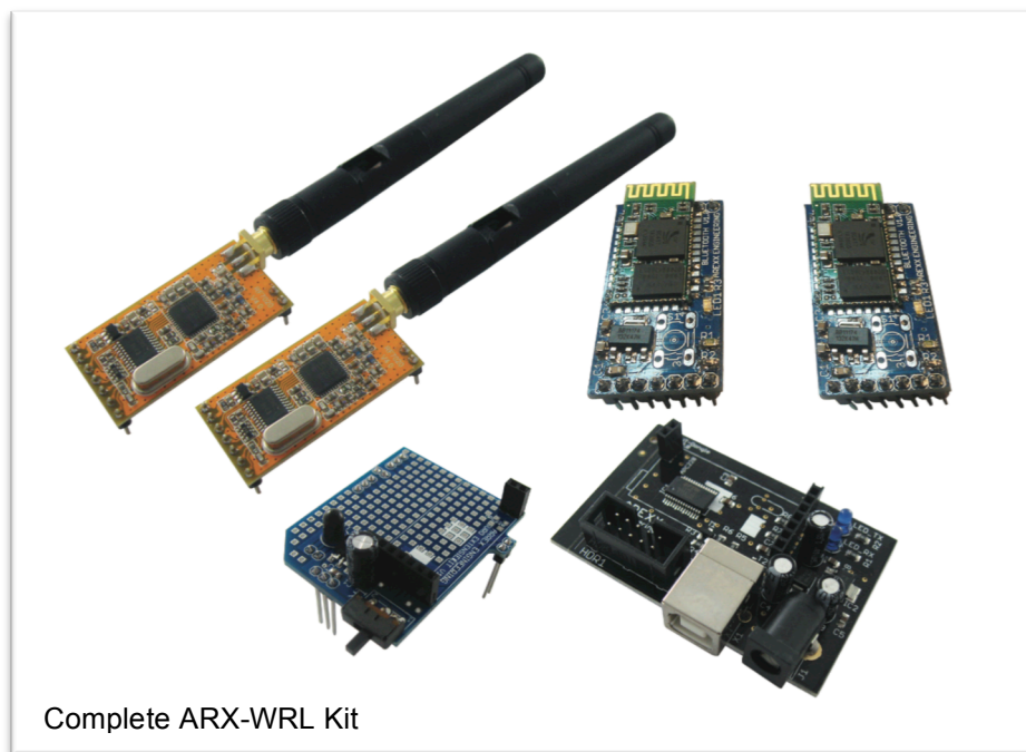
Complete ARX-WRL Kit