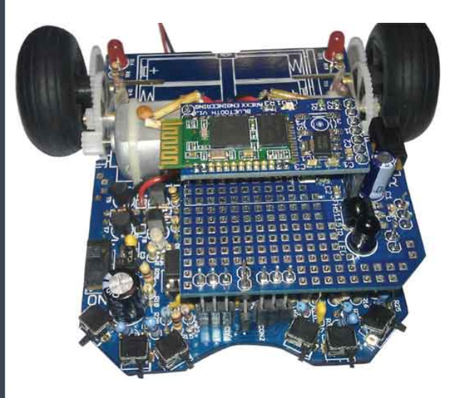
ASURO with BT3