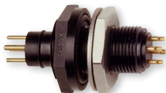
Male Bulkhead Connector