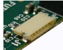
6-pin 1mm Header Mini-ISP