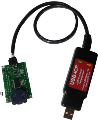
Example User Target Board (Not Part of Kit)