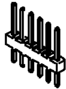
6-pin 0.1” Header Standard ISP