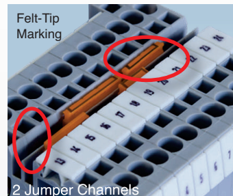
2 Jumper Channels