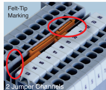
2 Jumper Channels