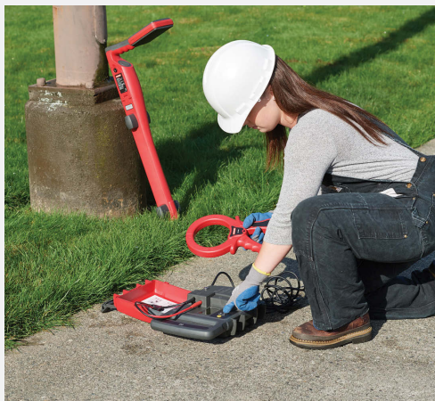
The Transmitter will automatically change modes based on which accessory is plugged in