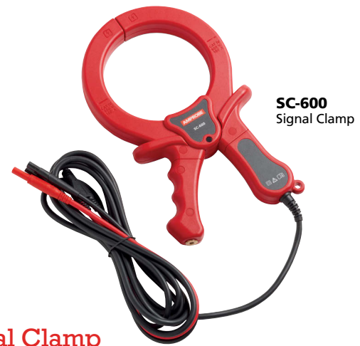
SC-600 Signal Clamp