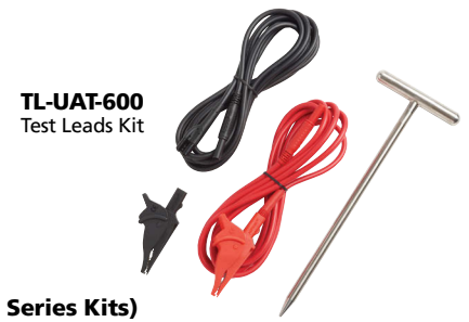
TL-UAT-600 Test Leads Kit

The Signal Clamp accessory provides an efficient and safe method of applying a locate signal to a cable, enabling the Transmitter to induce a signal through the insulation into the wires or pipes. The clamp works on low impedance closed circuits only.