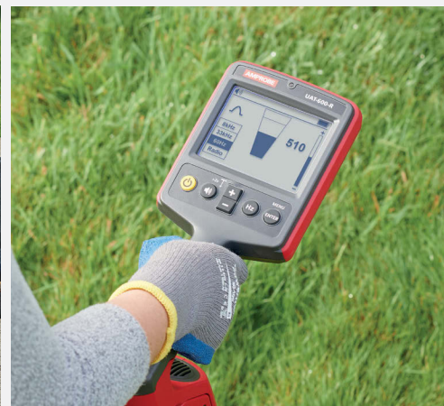
The Receiver's high contrast LED screen is easy to read in full sunlight