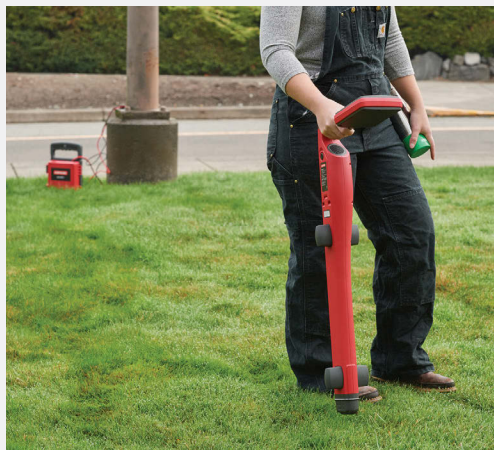
Trace an individual utility by connecting the transmitter directly with the test leads