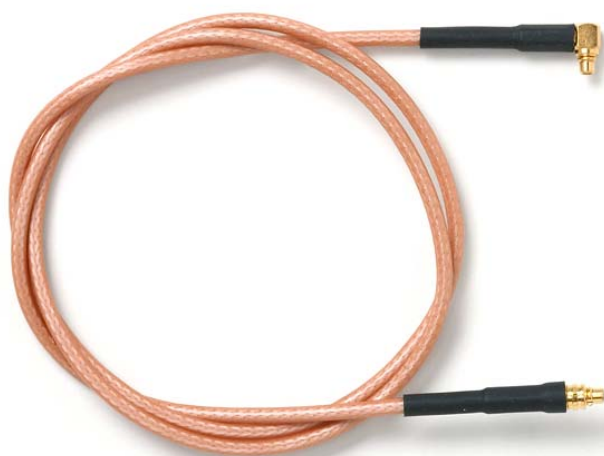
Model 73064 MMCX Plug to Right-Angle MMCX Plug, RG316/U

Snap-on coupling and micro-miniature size for fast connect and disconnect where space is limited