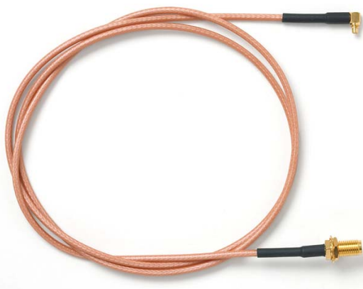
Model 73066 MMCX Right-Angle Plug to SMA Bulkhead Jack, RG316/U

Small size, and durability for confident connections