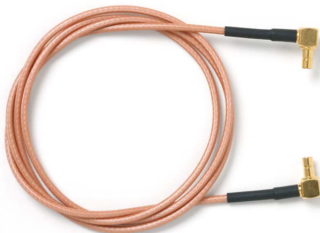
Model 73073 SMB Right-Angle Jack to SMB Right-Angle Jack, RG316/U

Snap-on coupling and small size for fast connect and disconnect