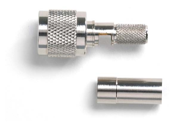
Model 73057 TNC Plug, 50 Ohm, Crimp Type, RG59, 62