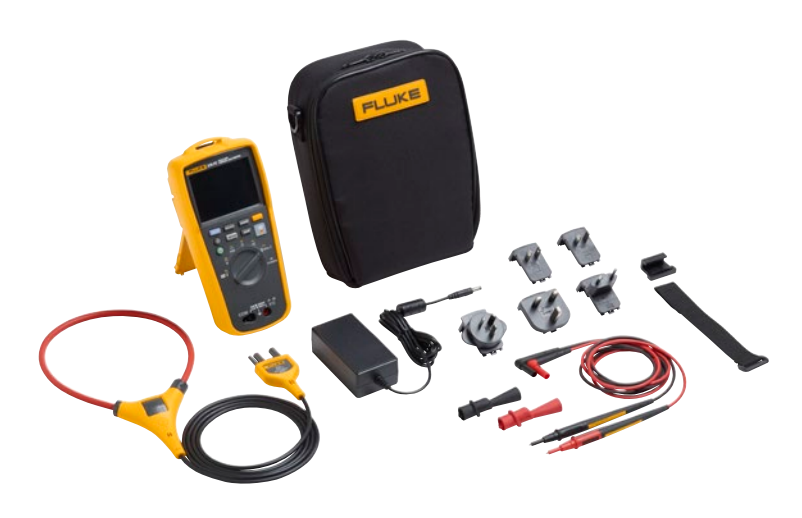
Figure 2. Fluke 279 FC/iFlex TRMS Thermal Multimeter Kit