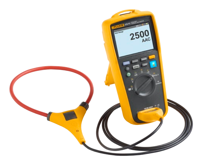
Figure 1. Fluke 279 FC with the iFlex Flexible Current Probe