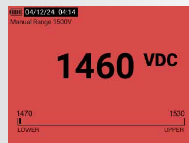
Limit gauge – outside of range