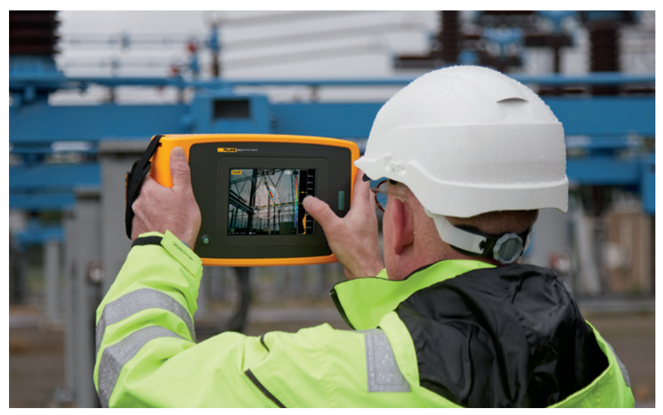
Image taken of the ii910 Precision Acoustic Imager detecting partial discharge in a high voltage application.