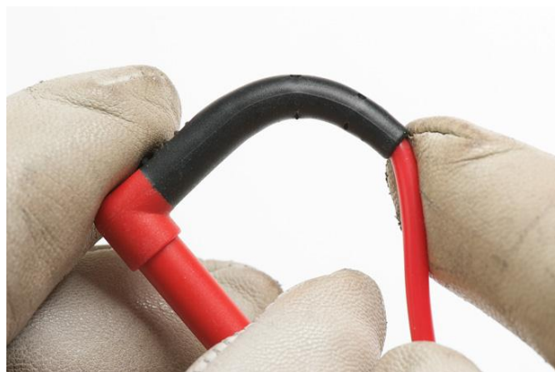
Extreme strain relief tested to withstand over 30,000 bends