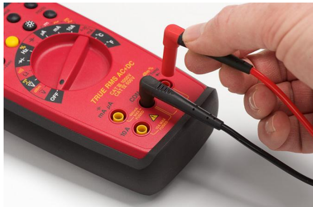
Universal plugs compatible with all 4mm shrouded inputs