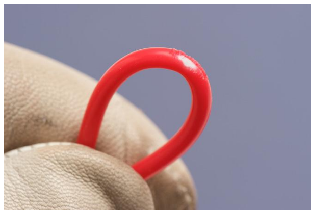
WearGuard™ indicator shows insulation damage

USA: Sales: 800-490-2361 Technical Support: technicalsupport@pomonatest.com Fax: 425-446-5844 Europe: 31-(0) 40 2675 150 International: 425-446-5500 Where to Buy: www.pomonaelectronics.com