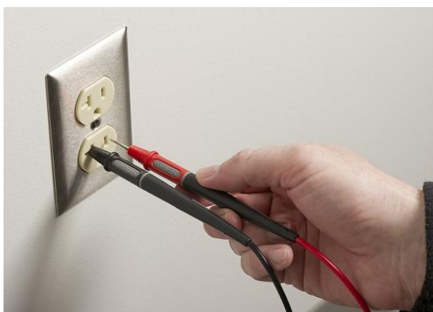
Increased tip exposure for CAT II probing