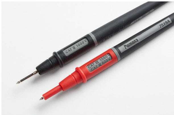
Probes always show the correct category rating for the tip exposure being used