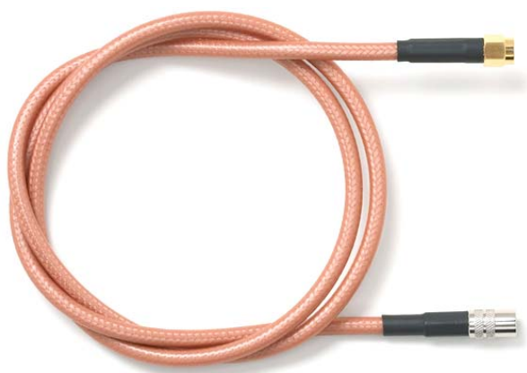
Model 73082 SMA Quick-Connect Plug to SMA Plug, RG142B/U

Small size, and durability for confident connections