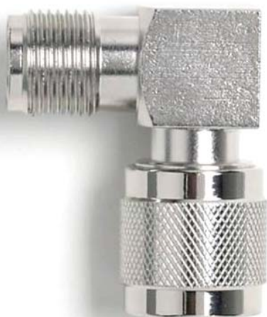
Model 73053 TNC Right-Angle Jack to Plug Adapter