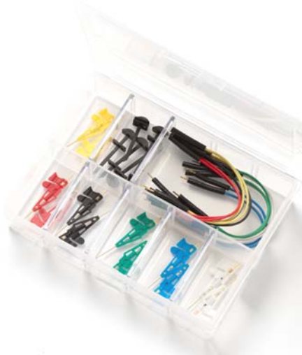
Model 72902 Micro SMD Grabber Test Clips Kit

For CE Compliance and for personal safety, do not hold in hand when voltages exceed 33 Vrms/70 Vdc. Maximum voltage for hands free use : 70 Vrms max.