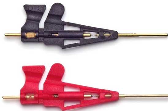
Model 72902-0 & 72902-2 Micro SMD Grabber Test Clips

Model: 72902 (Kit pictured on page 1) Model: 72902-* (Grabber pictured on the right) (* = Color, Available Colors: -0 (Black), -2 (Red)) Model: 72903 (Holding Rods on page 1, sold 10 per package)