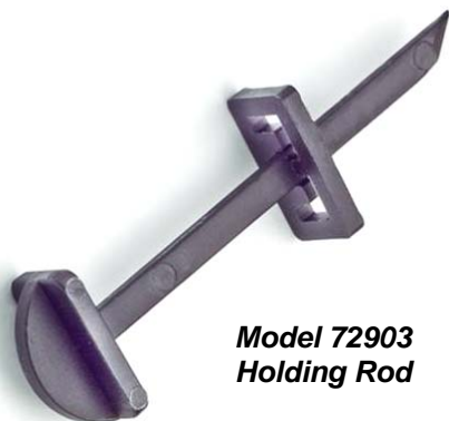
Model 72903 Holding Rod