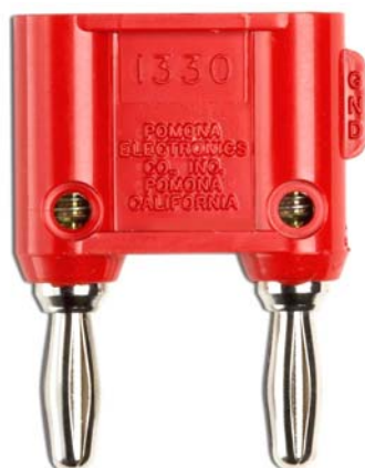
Model 1330 Double Banana Plug with Component Mounting Area