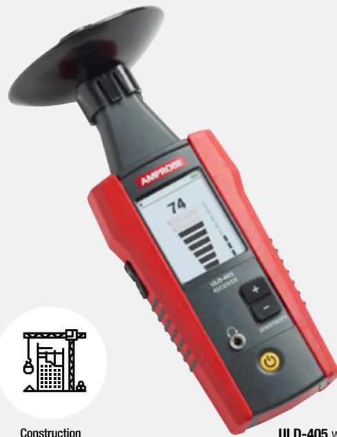
ULD-405 with Power Parabola