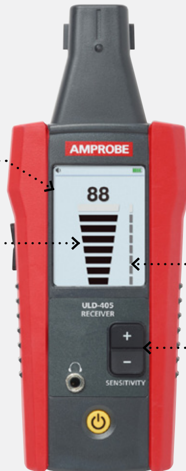
ULD-405 Ultrasonic Leak Detector