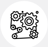
Motors and Machinery