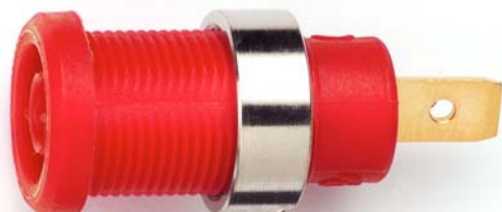
Model 72913 Panel Mount IEC61010 4mm (0.16in) Jack for Sheathed Banana Plugs

Panel Mt IEC61010 4mm (0.16in) Jack for Sheathed Banana Plugs