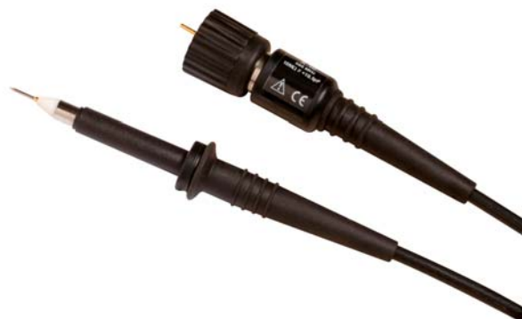
Model 6551 Microline Passive Oscilloscope Probe with Readout Actuator