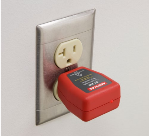
Plug the transmitter into an outlet and receiver will find the corresponding breaker.