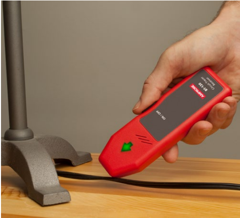
Designed for use in residential and light commercial environments.