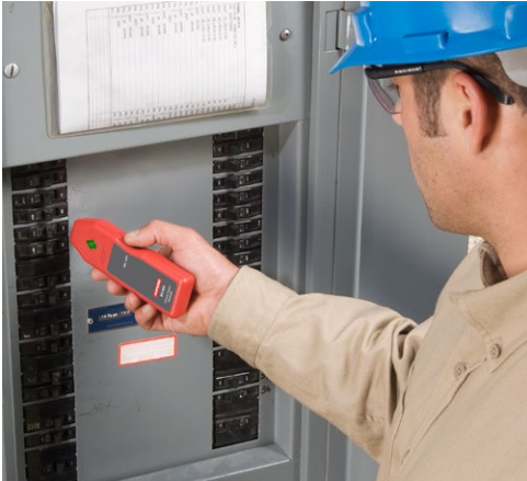
The receiver always finds the right breaker - automatic sensitivity adjustment removes ambiguity from the search by indicating single, correct breaker with light and sound.