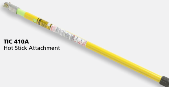
TIC 410A Hot Stick Attachment

The optional TIC 410A Hot Stick accessory enables easier tracing of wires in high ceilings, walls and along floors.