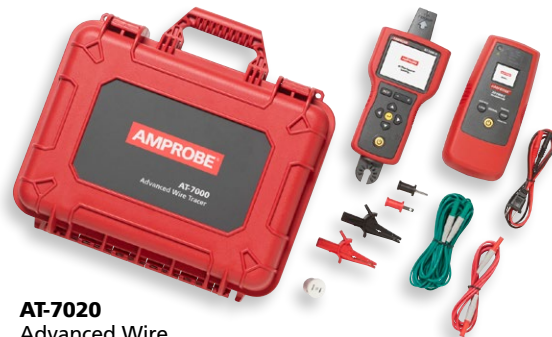
AT-7020 Advanced Wire Tracer Kit