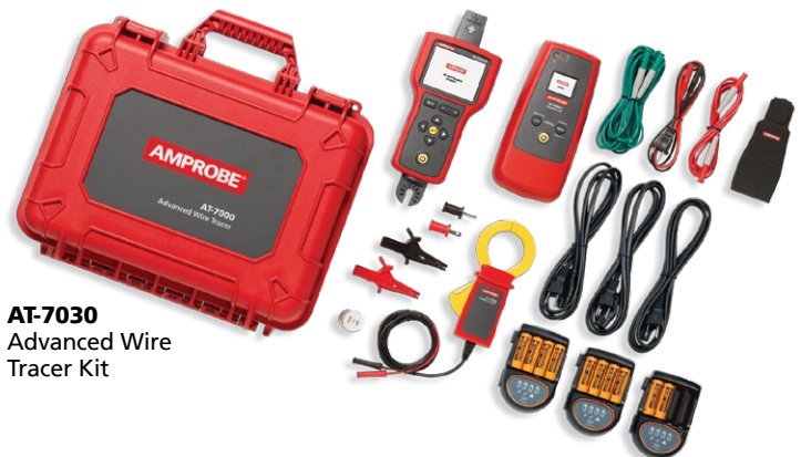
AT-7030 Advanced Wire Tracer Kit