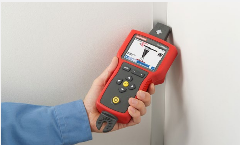
Use the Tip Sensor to trace wires in hard to reach areas.