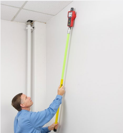
Trace wires in hard to reach places with the TIC 410A.