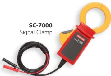
SC-7000 Signal Clamp

Featuring three power modes "high", "low", and "clamp" and two output frequencies (6kHz and 33 kHz), the AT-7000-T incorporates the best technologies available for optimal wire tracing and breaker identification on both energized and de-energized circuits. The AT-7000-T automatically sets the frequency based on detected voltage, and prompts the user to set the power level based on their application. The color TFT LCD screen displays the detected voltage, frequency output and power mode.