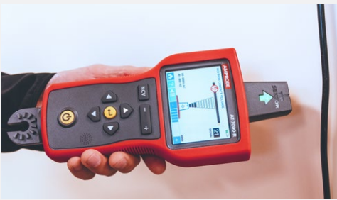
Non-contact voltage (NCV) detection.