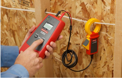
Induce signal with the signal clamp when there is no bare conductor.