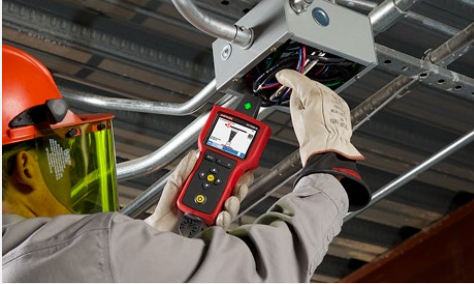
Trace energized or de-energized wires by removing the junction box cover.