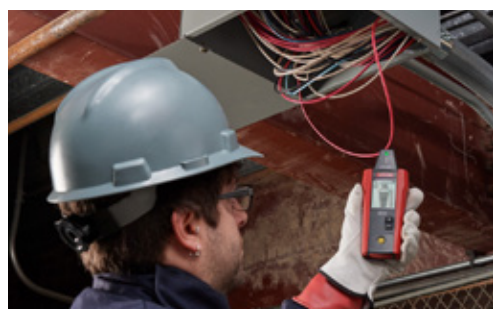
Locate a specific wire