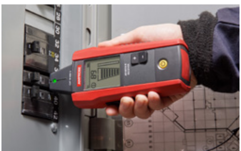
Identify the single correct breaker