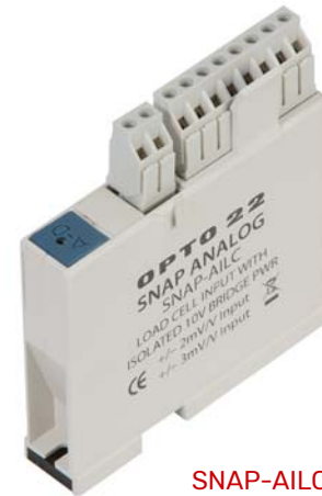
SNAP-AILC Load Cell Module