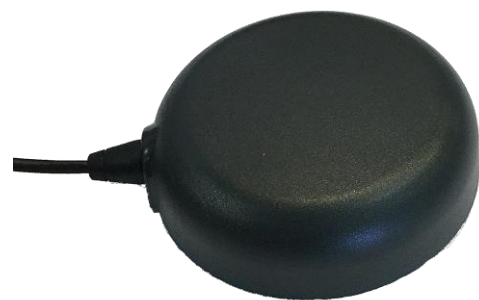
TW7872 Dimensions (mm)

This product is also available in an OEM format (TW3867 for 28dB and TW3872E for 35dB)