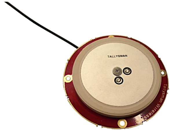
TW2106 Dimensions (mm)

The TW2108 has a pre-filter to provide strong protection from near frequencies.