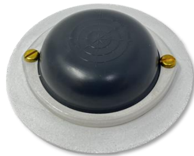
SSL889XF-2 (mounting ring) Ground plane not provided