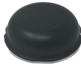
SSL889XF-3 (adhesive tape)