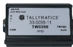
RS-422 Serial to USB Bridge

60 Days Complementary PointPerfect GNSS Augmentation Service