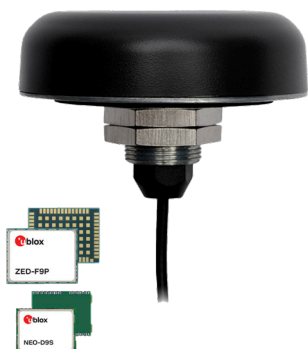
TW5394 Smart GNSS Antenna