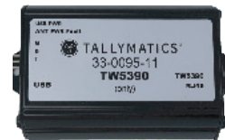
Serial to USB Bridge

Plug and Play Point One Navigation Polaris RTK Service