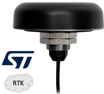
TW5387 Smart GNSS Antenna